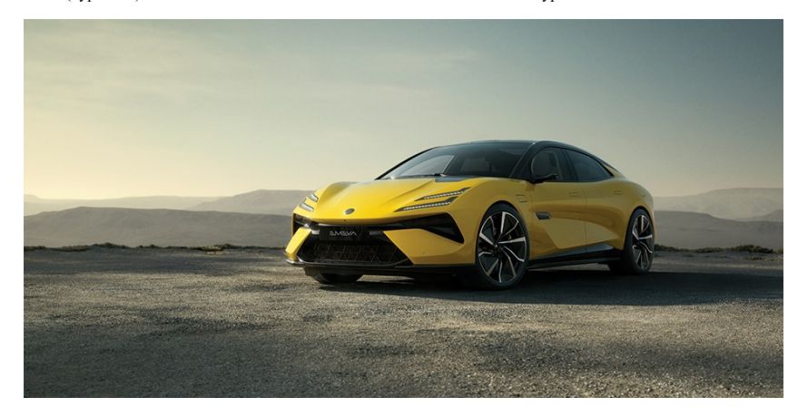
Emeya is being developed based on the same advanced EPA architecture and adopting the same strong aerodynamics and intelligent driving system as Eletre. Powered by our high-power dual motor, Emeya can deliver an acceleration from zero to 100 km per hour in 2.8 seconds, making it one of the fastest electric GTs in the world. Equipped with our supercharging feature, Emeya can reach 150 km range with five minutes of

Emeya (Type 133), a four-door luxury and performance vehicle, is our second lifestyle vehicle and first hyper grand tourer (hyper-GT) vehicle. It is also one of the world's most advanced electric hyper-GT vehicles.